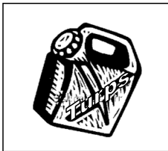
Clean equipment with turps