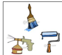
Roller Brush Spray