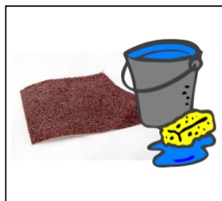
Clean and sand if necessary