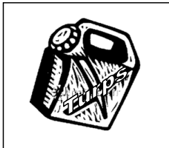
Clean equipment with Turps