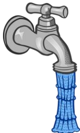
Clean equipment with water