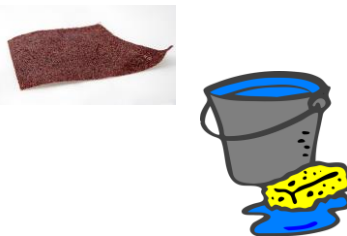
Remove loose flaking paint Sand, dust + clean