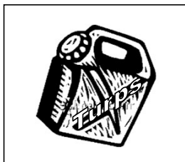
Clean equipment with turps