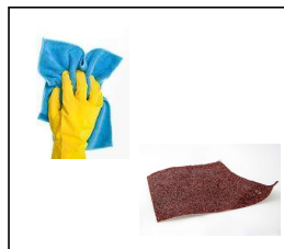
Clean and sand if necessary