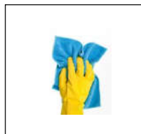
Clean the surface