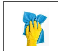
Cloth or Mop