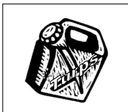
Clean equipment with turps