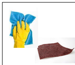
Clean the surface and sand if necessary