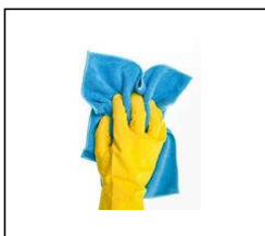
Degrease + treat surface with appropriate cleaner