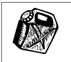
Clean equipment with QD Thinners