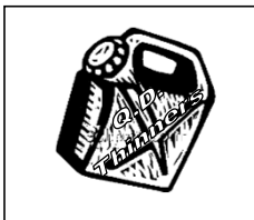
Clean equipment with QD Thinners