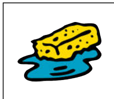
Degrease + treat surface with appropriate cleaner