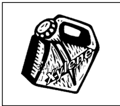
Clean equipment with Xylene